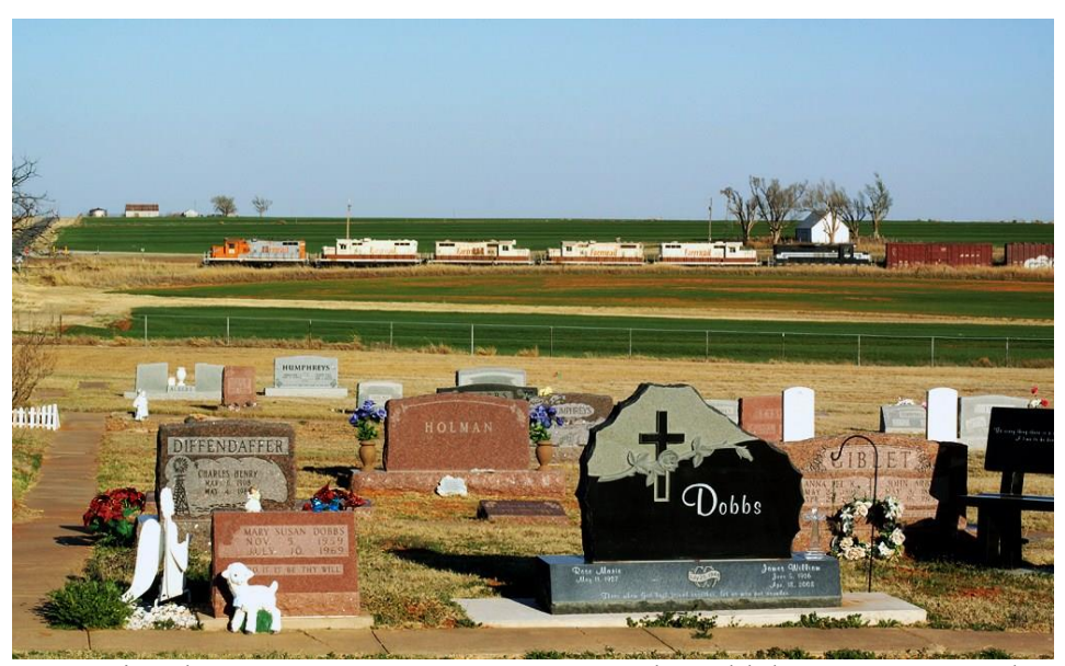
International scene! Lone Star Cemetery, Rocky, Oklahoma, U.S.A.