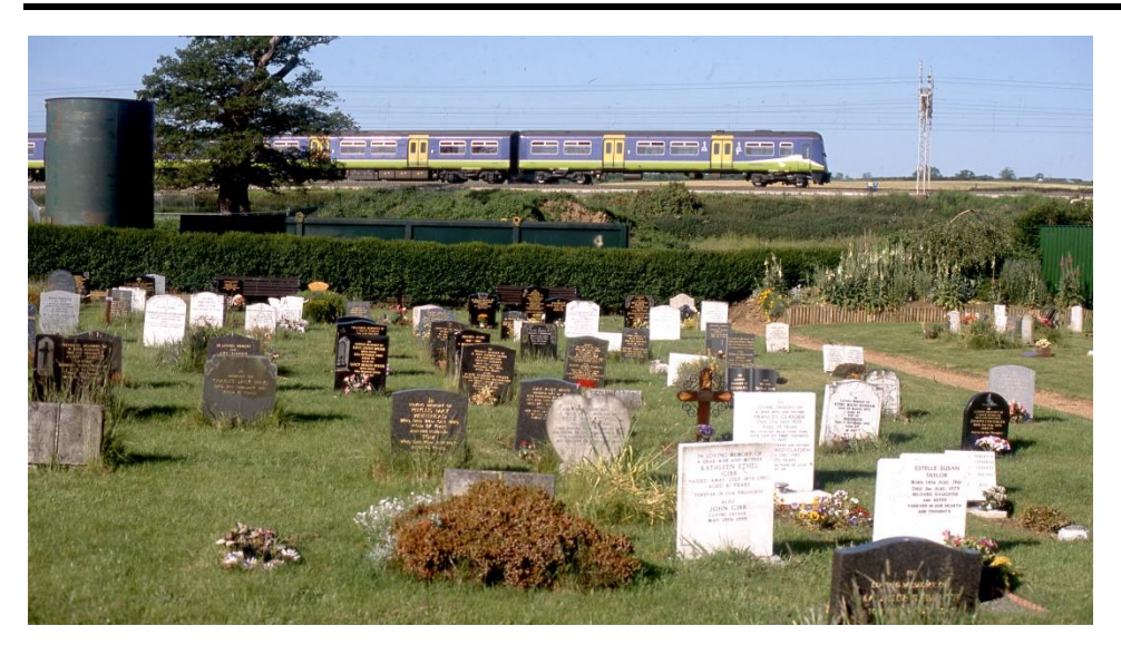
Railfan cemetery? Old Linslade Cemetery near Leighton Buzzard.